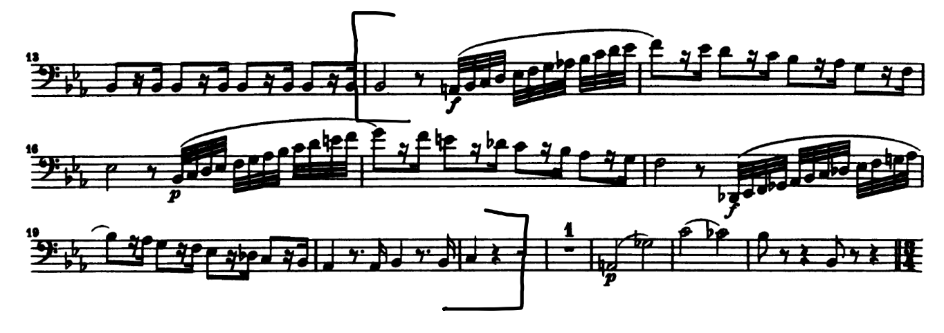
1<sup>st</sup> movement (Allegro) measure 293 to end

1<sup>st</sup> movement (Adagio) measures 14 through 21